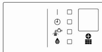
Wireless Remote Controller Kit